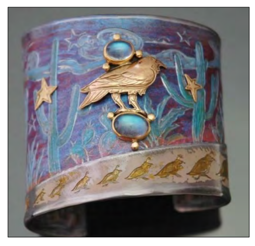
Recycled steel, 14K gold, gemstones

Carson says his work is a combination of basic techniques and vision, adding "The process is simple, the materials are accessible, and everyone with a vise, a saw, a grinder, and a few hammers can pretty much do what I do. It's how someone's artistic temperament and sense of design come into play that's important."