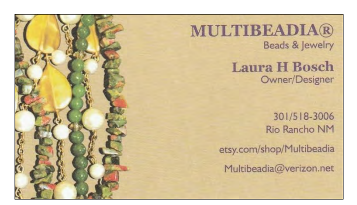
10% discount for BSNM members Use code BSNM10