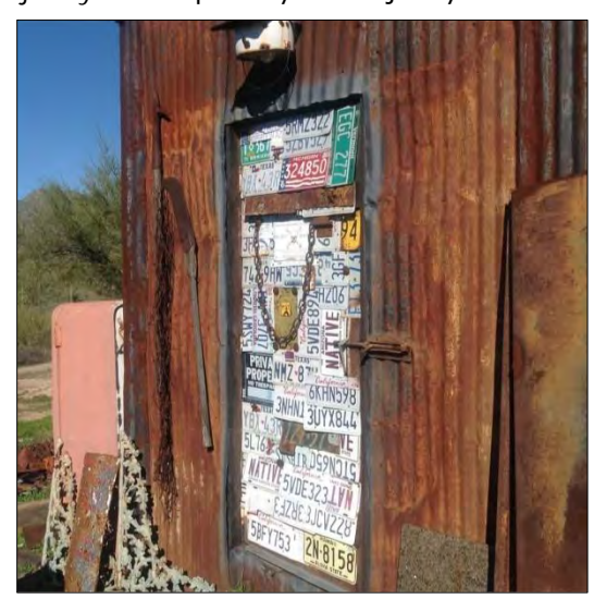
A series of license plates ready for their next life